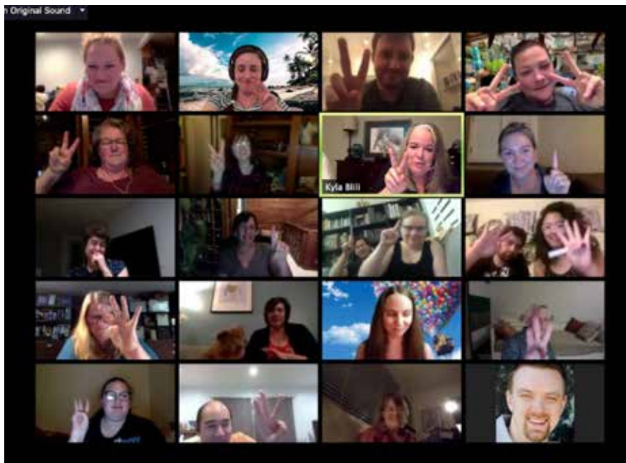
Zoom rehearsals – the status quo for Spring 2020 and the foreseeable future

In lieu of preparing for a May concert, the singers of Resounding Achord met together online — thank goodness for Zoom— to maintain the singing community that we have worked so hard to build. We sang, celebrated life's milestones, learned new techniques, played games, and worked together on our first of many virtual performance offerings that we are affectionately calling " Resounding Apart ." We plan to continue this work until we can rehearse together again, with the goal of releasing monthly videos to our extended community.